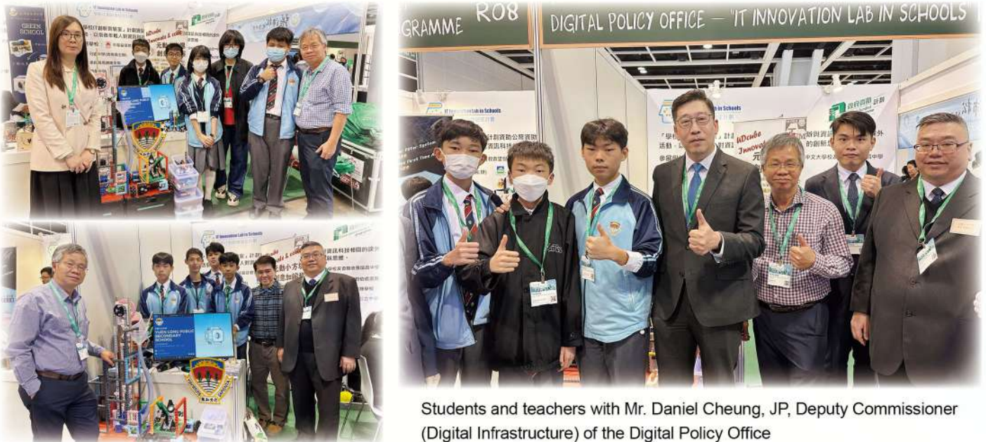
Students and teachers with Mr. Daniel Cheung, JP, Deputy Commissioner (Digital Infrastructure) of the Digital Policy Office

A basic and standard unit in the form of a 3D printed cube was drawn using SketchUp and developed into various components and structures in our school. Students, using the printed components and structures or designing their own, learned to develop design thinking, robotic programming, and problem-solving skills. The Expo provided an exceptional opportunity for them to share their experiences and achievements in IT learning.