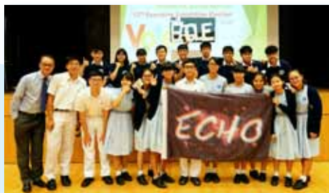
學生會 Student Association