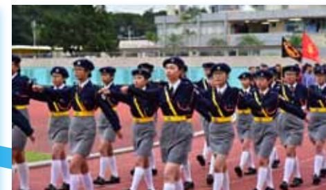
交通安全隊 Road Safety Patrol