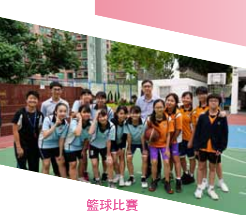
籃球比賽 Basketball Competition