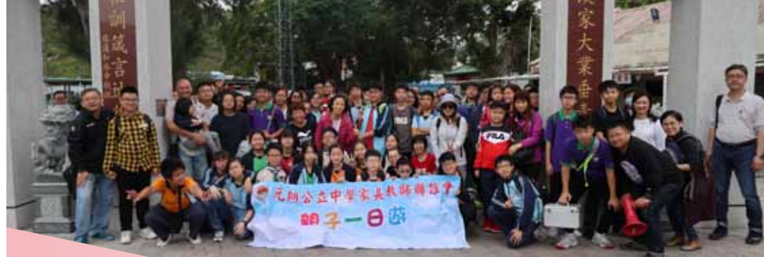
家教會親子一日遊 PTA Outing