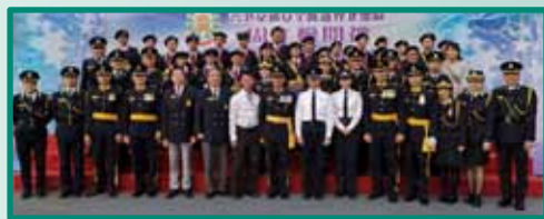
Annual Inspection Ceremony of the Hong Kong Road Safety Patrol (New Territories North Region) 2018/2019 - Champion and First Runner-up Annual Parade of the Hong Kong Road Safety Patrol (New Territories North Region) 2018/2019 - Second Runner-up 香港交通安全全隊 新界北總區周年檢閱禮步操比賽 2018/2019 - 冠軍及亞軍 香港交通安全隊周年大會操 2018/2019 步操比賽 - 季軍