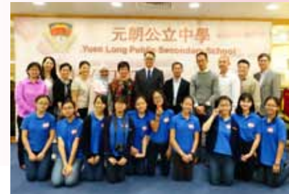
第17屆新加坡-香港交流計劃(2018年7月及11月) The 17th Singapore- Hong Kong Exchange Programme (July and November 2018)