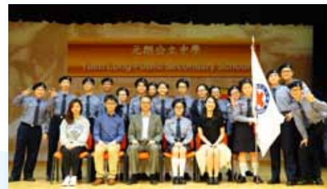
香港紅十字青年團 Hong Kong Red Cross Youth Units