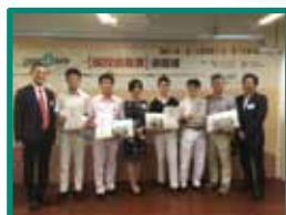
HKEdCity & HKUST CODE2APP Challenge - Champion 香港教育城及科技大學 編程挑戰賽 - 冠軍