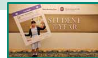
South China Morning Post Student of the Year (Community Contributor) 2018-19, - One of the Twelve Finalists 南華早報年度學生獎 - 社區貢獻 2018-19 - 十二名決賽入圍者