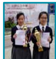
新知識文化學術研習 社夢盃演講比賽 - 高中組冠軍 - 初中組冠軍