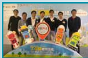
STEM Product Proposal and Design Competition, HKIE - First Runner-up 香港工程師學會 STEM 方案設計比賽 - 第二名