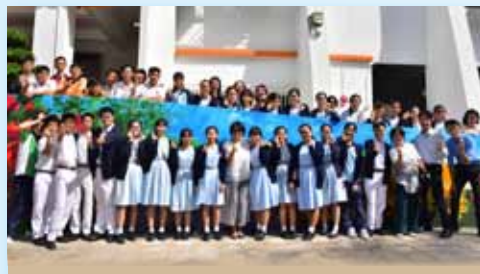
朋輩大使 Peer Counsellor