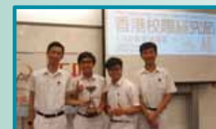
Liberal Studies Cup on STEM Education, The Hong Kong Schools Research Festival, - Second Runner-up 香港校際研究節 2019 STEM 教育通識盃 - 季軍