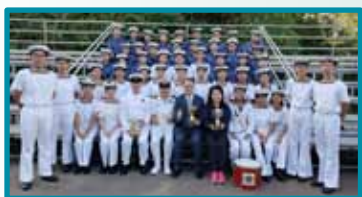
HK Sea Cadet Corps - Footdrill Competition 2018, - The Best Team - Outstanding Performance Award - The Overall Champion 香港海事青年團隊步操比賽 2018 最佳步操隊伍 - 全場總冠軍