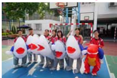
社活動 House Training