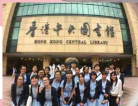
參觀香港中央圖書館 Visit to Hong Kong Central Library