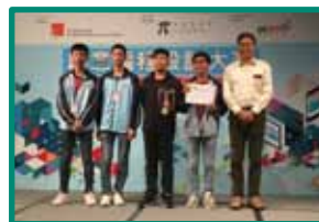
Creative Coder Competition, The HK Federation of Youth Groups - Second Runner-up (Senior Form) 香港青年協會創新科技中心 創意編程設計大賽 - 高中組第三名