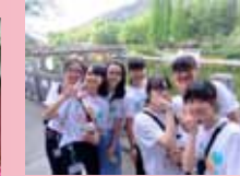
百仁之友— 義傳貴州交流活動(2019年4月) Tour to Guizhou (April 2019)