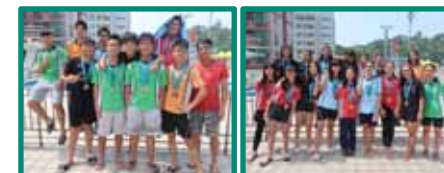
香港學界體育聯合會 元朗區中學分會中學 校際游泳比賽 2019 - 男子組全場第五名 - 女子組全場亞軍 - 女子甲組團體季軍 - 男子乙組團體亞軍 - 女子乙組團體冠軍 - 男子丙組團體殿軍 - 女子丙組團體季軍