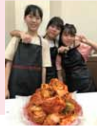
廣州增城訪校之旅(2019年7月) Exploring Tour for Zengcheng history, culture and Visit to Sister School (July 2019)