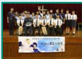
The New Territories and Kowloon West Foot Drill Competition 2018-19 - First Runner-up 香港基督少年軍 新界西九龍西區步操比賽 2018-19 - 亞軍