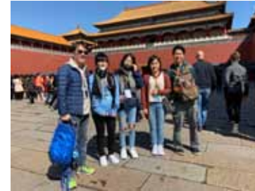
教育局「領袖生內地交流計劃—北京」(2019年4月) Mainland Exchange Programme for Student Leaders: Beijing (April 2019)