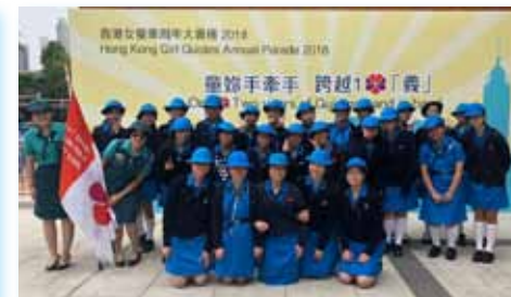
女童軍 Girl Guides