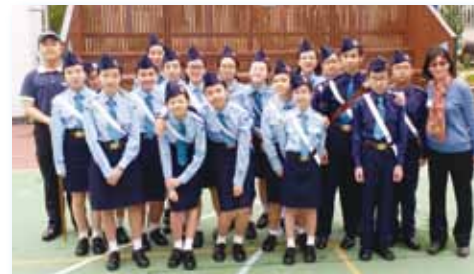
基督少年軍 Boys' Brigade