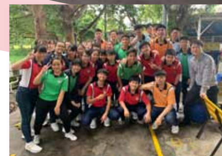
一班一活動 One Class One Activity