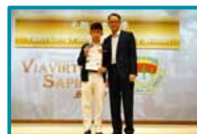
Huaxiabei National Mathematics Olympic Invitation Competition 2018 - (Great China) Second Class Award - (Great China) Third Class Award - (South China District) Second Class Award - (South China District) Third Class Award - (Hong Kong District) Second Class Award - (Hong Kong District) Third Class Award The Asia International Mathematical Olympiad Open Contest (Semifinal), - Silver Award and Bronze Award Hong Kong & Macao Mathematical Olympiad Open Contest, 2019 - Gold Award, Silver Award and Bronze Award MathConception Inter-School Contest 2019 - Bronze Award