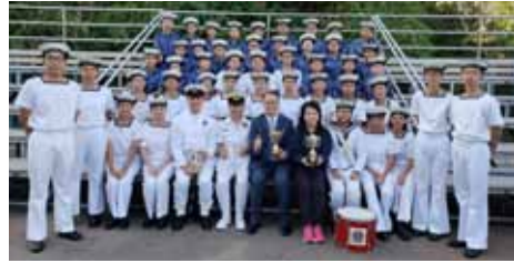
海事青年團海外交流計劃—加拿大(2019年8月) ISCA International Exchange— Canada (August 2019)