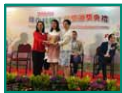
Greening School Project Award (Small Garden Plot, Secondary School), Leisure & Cultural Services Department - Champion 康樂及文化事務署綠化校園資助計劃 - 小園圃種植中學組冠軍