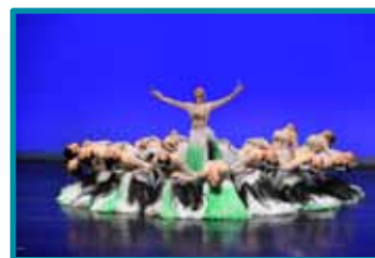
The 55th Schools Dance Festival, The Education Bureau and the Hong Kong Schools Dance Association Limited, - Chinese Dance (Group Dance) Highly Commended Award - Chinese Dance(Solo) Honours Award 教育局及香港學界舞蹈協會有限公司聯合主辦 第 55 屆學校舞蹈節 - 中國舞 (群舞) 甲級獎 - 中國舞 (獨舞) 優等獎